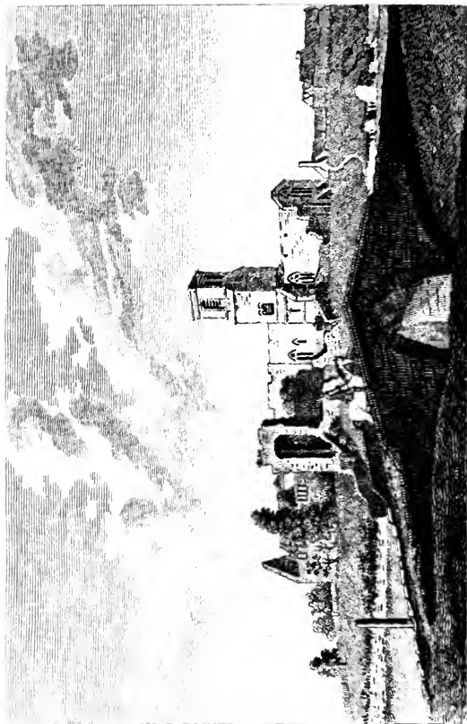
The Monastery of Sarreweien the Year 1793. It has been and shall